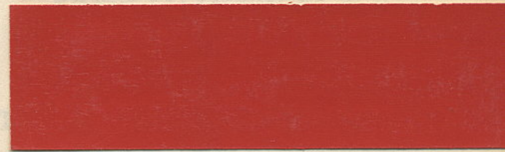
6620 INDIAN CERAMIC