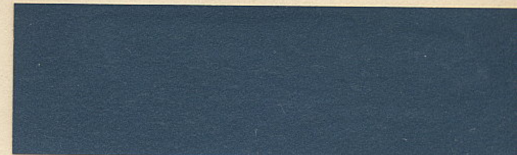
6550-G HORIZON BLUE METALLIC