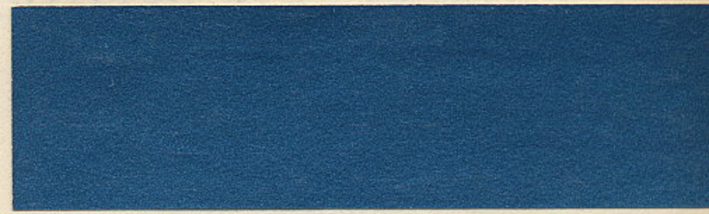
6581-G BLUE SATIN METALLIC