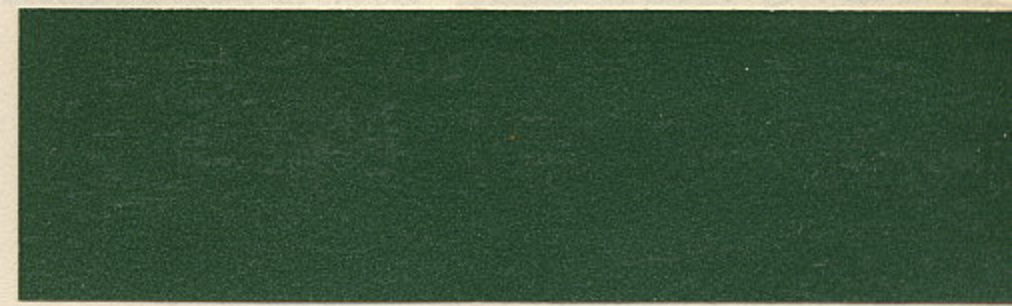
6584-G GARDEN GREEN METALLIC