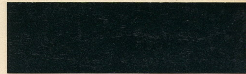
6674-G CRYSTAL GREEN METALLIC