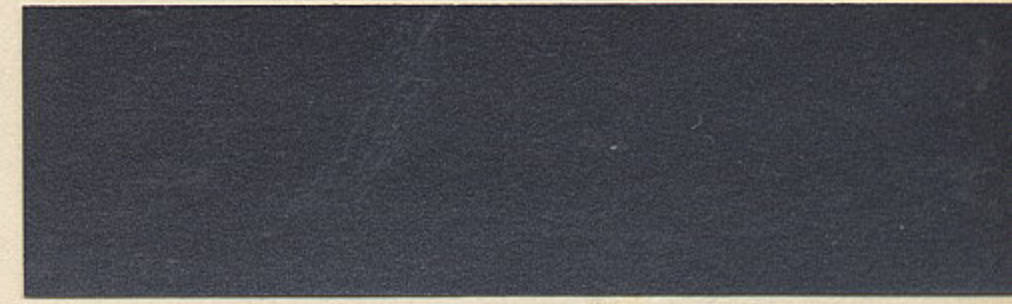
6582 SUEDE GRAY METALLIC