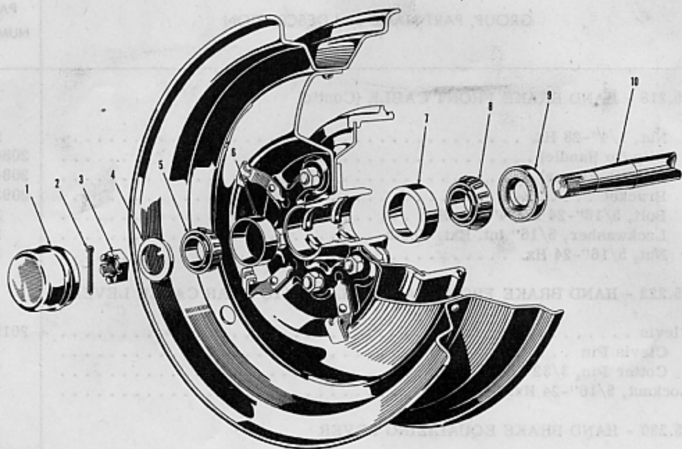
FIGURE 16-1 — TYPICAL FRONT WHEEL AND BEARINGS - EXPLODED VIEW